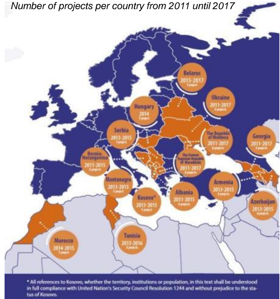
Number of projects per country from 2011 until 2017

Promoting the implementation of standards in the fields of freedom of expression and information and media freedom